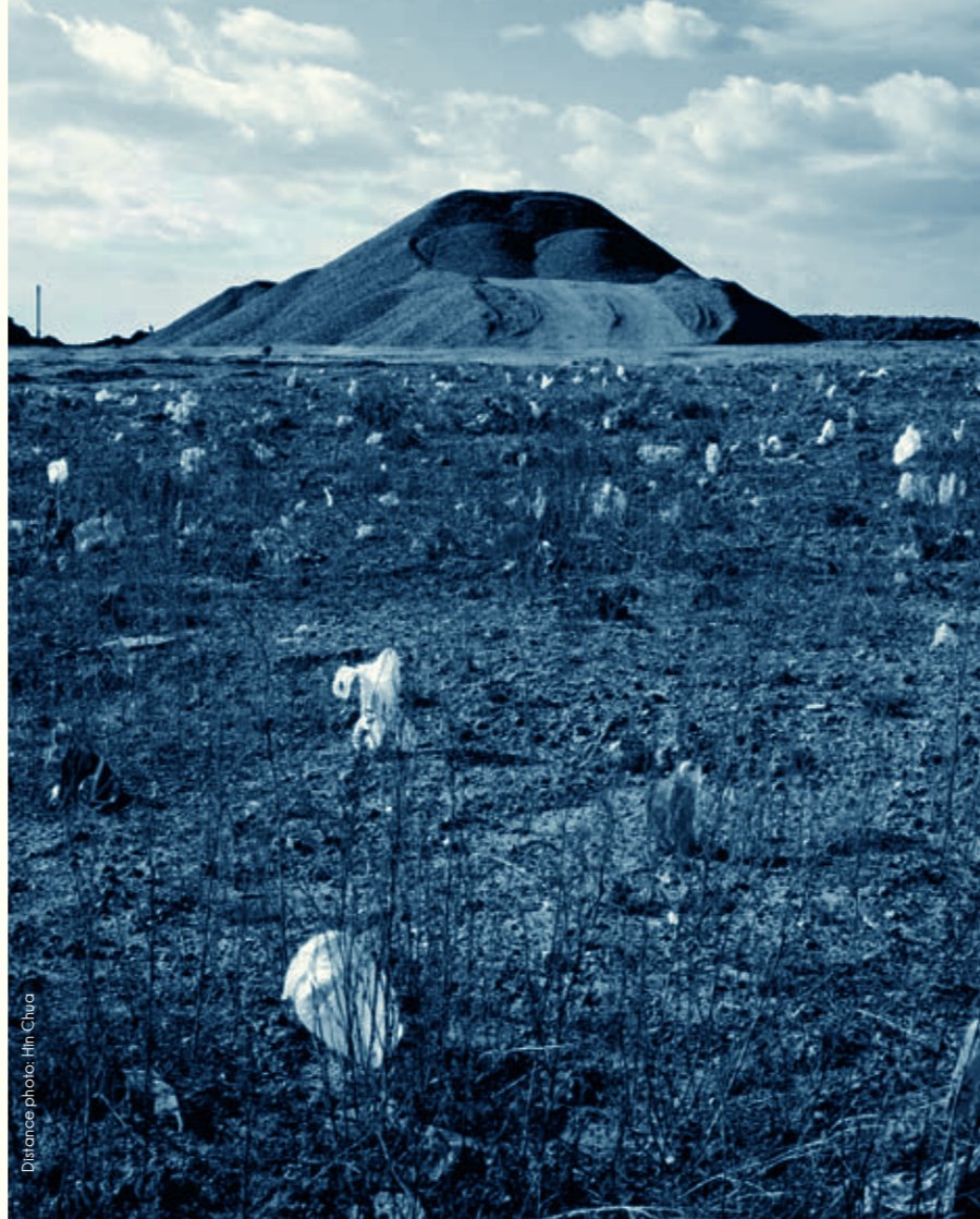
Distance photo: Hin Chya

www.stevenlevon.com | www.stevenlevon.com/amateurs